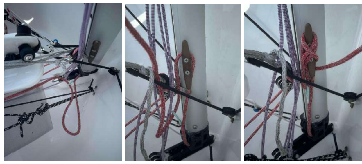
APPENDIX B Lark Main Halyard Rigging instructions

Pass a bight through the green spliced loop. Loop the bight over the horn cleat (inside the board controls). Pull up and cleat as usual.