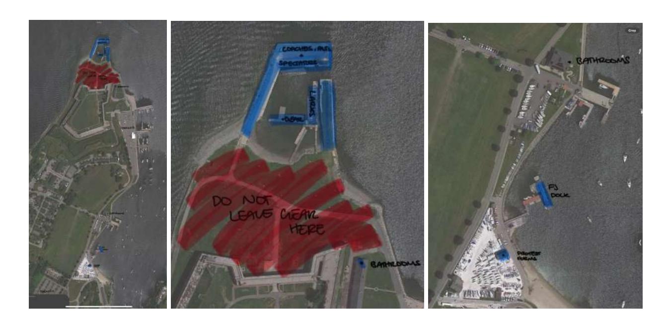
APPENDIX C Venue Map

Pass a bight through the green spliced loop. Loop the bight over the horn cleat (inside the board controls). Pull up and cleat as usual.